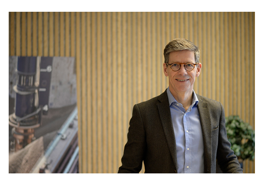
50 YEARS OF INNOVATION: DRIVING DRY BULK HANDLING

You can find out more about the stories and legacy of our company and its Siwertell ship unloading technology, spoken in the words of our directors, over the following months here.